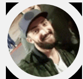
Azad Sayak Medical University in Romania

"Well where do I start... Students who go through Medlink Students must realise that a miracle is about to happen in their life journey. I was so confused and stressed about not making it to medicine until I came across the Medlink Students. Their team assured me that I should not worry about making my dream come to reality. The communication was excellent. You can literally get your questions answered 24/7."