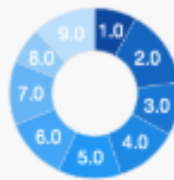
Krok 1. Stomatology